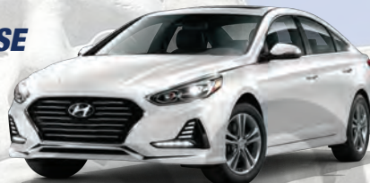
2018 SONATA SE