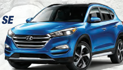
2017 TUCSON SE