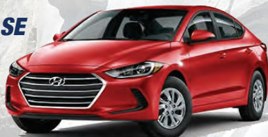
2018 ELANTRA SE

0% FINANCING UP TO 60 MONTHS on select models