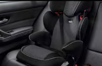
Child Car Seat